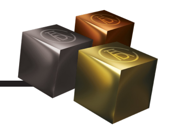
ILLUSTRATION BY ENTRANT

Includes Gold, Silver, and Bronze Cube winners. The ADC 101<sup>ST</sup> Annual Awards winners will be announced during Creative Week, May 18<sup>TH</sup>