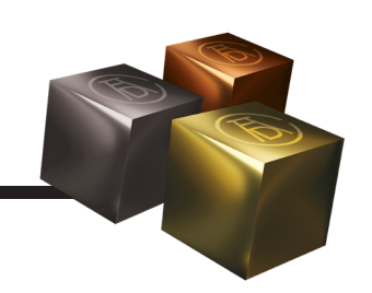
ILLUSTRATION BY ENTRANT

The ADC 101st Annual Awards winners will be announced during Creative Week, May 18<sup>™</sup>